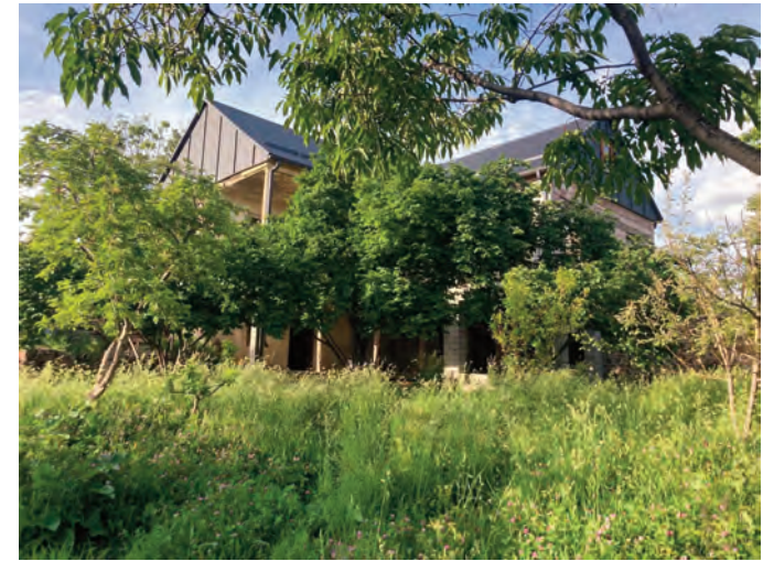
Land surface 1500 m 2