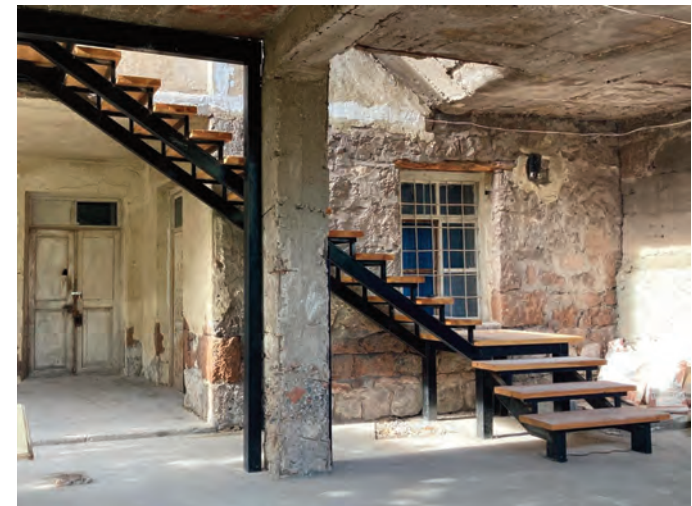
Building surface 336 m 2